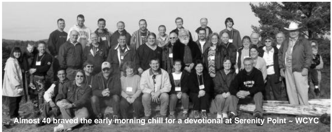
Almost 40 braved the early morning chill for a devotional at Serenity Point ~ WCYC

Thank you LeRoy, the WCYC staff and board members for hosting another excellent Workshop. Well done!!