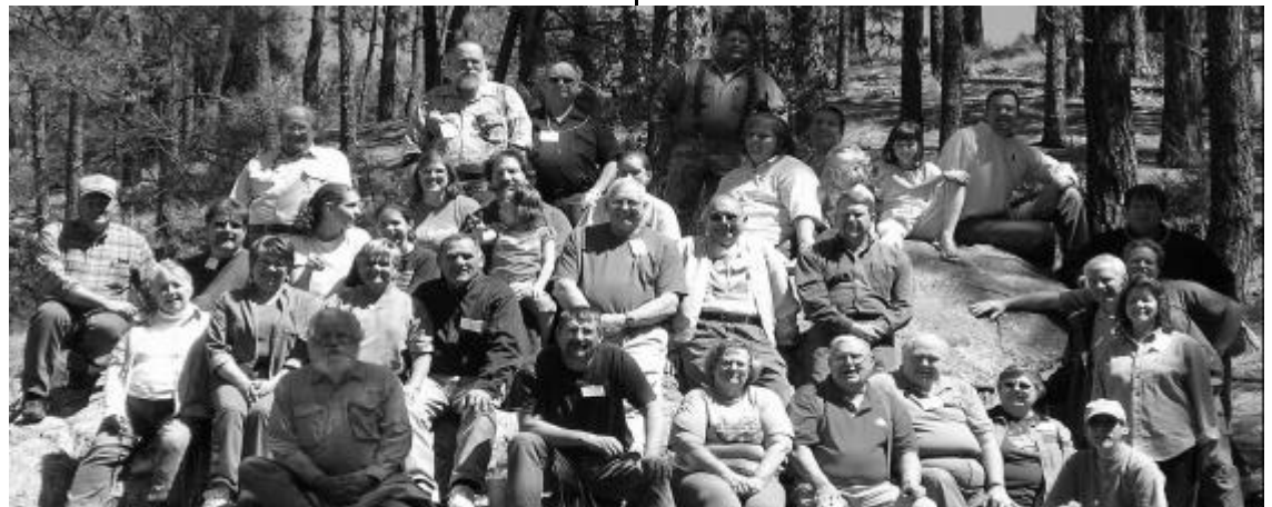
Some of the 50+ Camp Workers at the Copper Basin 2005 Workshop